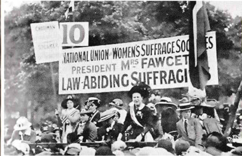
On July 26, 1913, 50,000 NUWSS supporters from all across Britain rallied in Hyde Park for the right to vote.

Because the vote is the best and most direct way by which women can get their wishes and wants attended to.